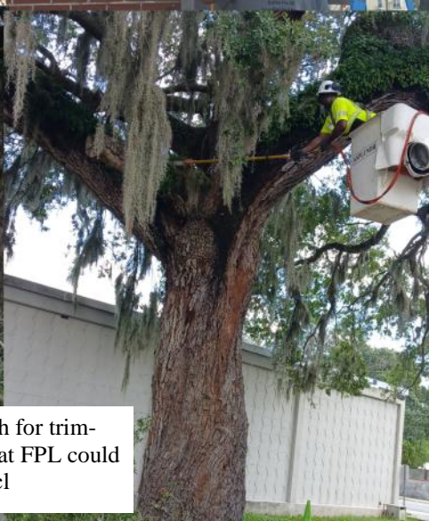
Thank you Asplundh for trimming our trees so that FPL could hook up our Electricl