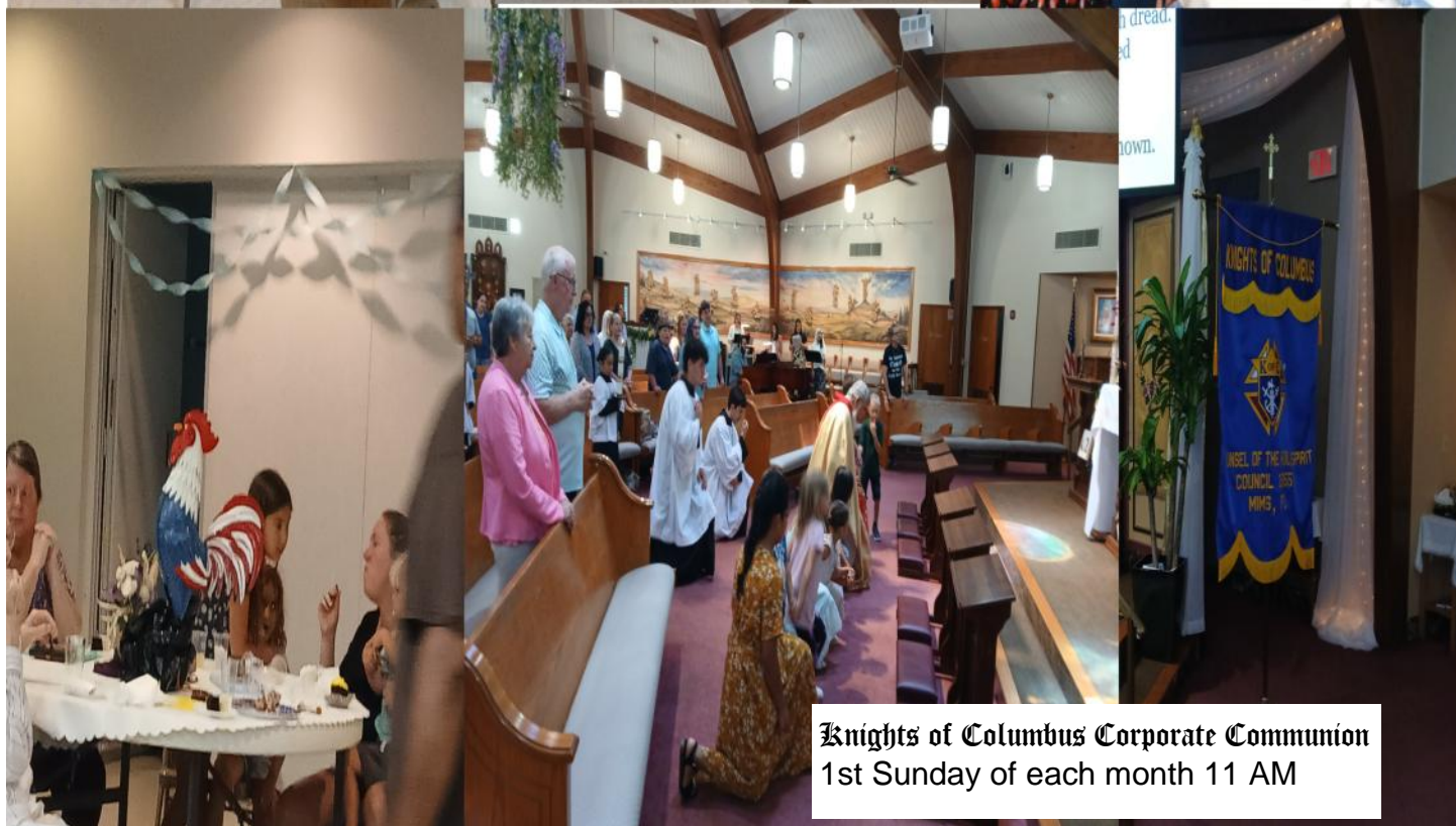
Knights of Columbus Corporate Communion 1st Sunday of each month 11 AM